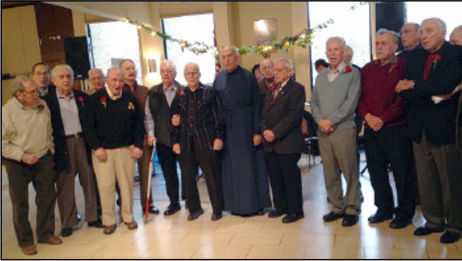
Parishioners who are veterans from several wars were honored during Koukla's Kafenio.