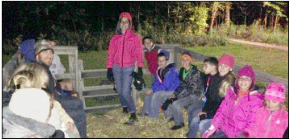
Synaxis hosted a family fall hayride Oct 11 at Knoch Knolls Park, Naperville. Everyone enjoyed a hayride through the woods and along the river at this 255 acre wooded park. Afterwards, they roasted marshmallows and visited around the campfire.

Directories are now available for pickup after The Divine Liturgy or weekdays in the church office.