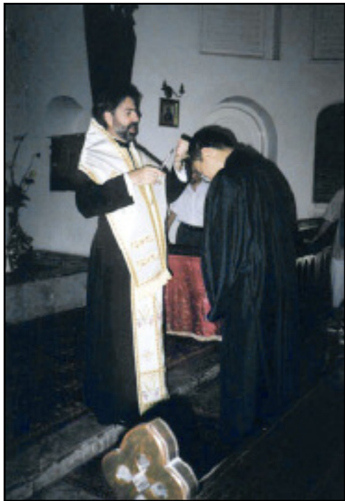
Metropolitan Nikitas ordains a reader in Singapore, above, and visits a school, right, also in Singapore.