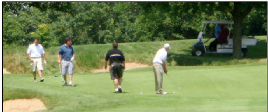
Refreshments are served, left, while others putter around.