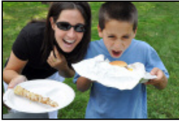
Great food above, followed the Liturgy in the park's shelter, right.