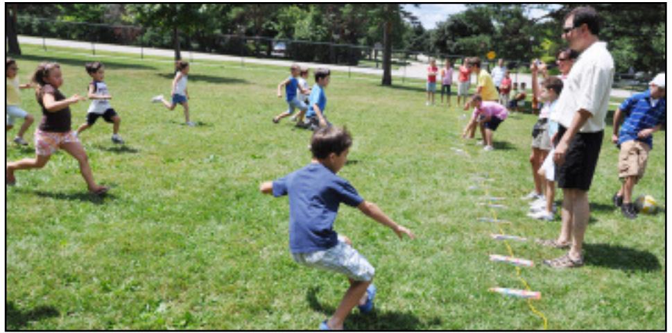
Games for the children are always a highlight of the annual Holy Apostles picnic.

Following my heart surgery, I entered into a rehabilitation program to strengthen the heart muscle. I found walking in Yorktown