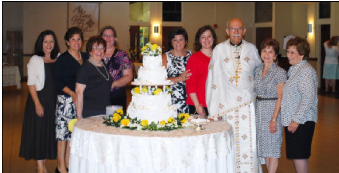
The Philoptochos Committee organized the special marriage celebration day and reception.