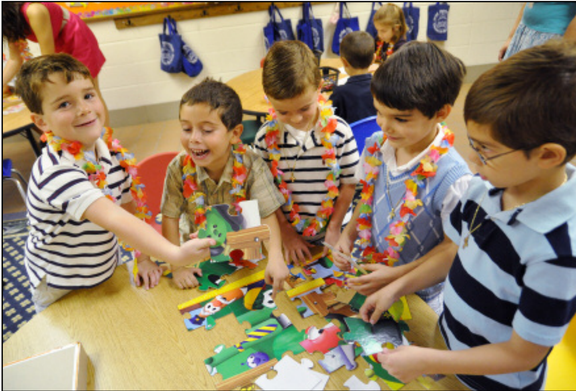
An energetic group of kindergartners get down to business assembling puzzles on the first day of Sunday School.