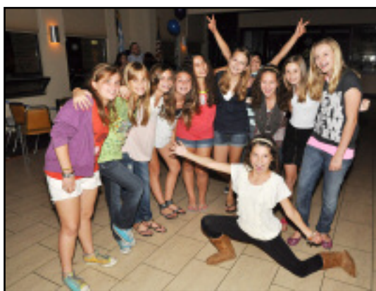
Above and right, Fanari campers enjoy each others' company at a recent reunion dance.