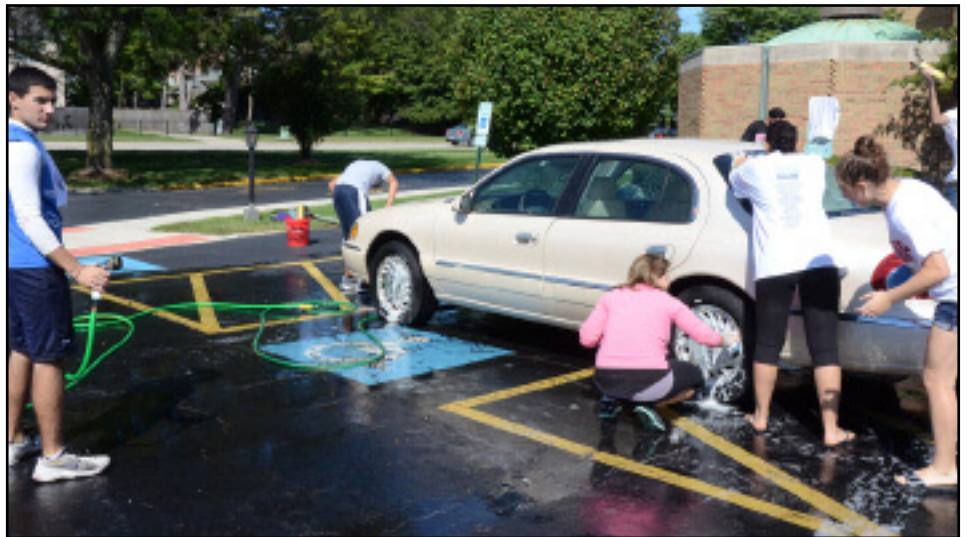
Twenty Goyans spent Saturday, September 14 scrubbing and washing down cars to raise money for a trip to Boston in 2014 and had a good time doing it.

The remarkable thing about it all was that Truman didn't believe any of it. On his cross-country whistle-stop tours, the first question every reporter asked in joining the train was, "Doesn't he know?" Nobody seemed to want to tell Truman that he was licked. "The most impressive thing about President Truman," Life magazine wrote, "was his incredible ability to pretend that nothing was wrong. Finally there was the edition with photographs of Truman cackling over a copy of the Chicago Tribune with its embarrassing DEWEY DEFEATS TRUMAN headline. I have often wondered what sustained President Truman through that "hopeless" campaign. Looking back we realize that something sustained him, some kind of inner strength kept him going. Truman wasn't a particularly religious man so we can't identify that as the source.