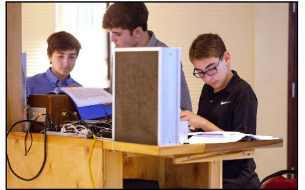
Adventure Theater cast members, above, presented the radio play Out on a Limb and will be turning their talents to a new play Inside the Walls in December.